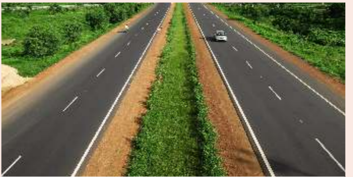
PRIME LOCATIONS NEAR HIGHWAYS