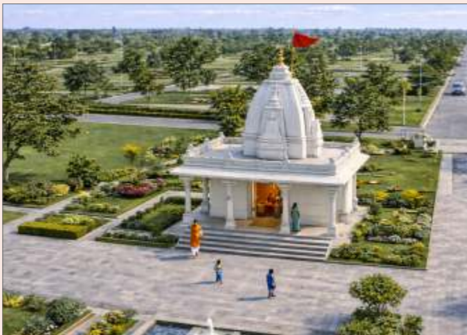
TEMPLE IN THE PREMISES