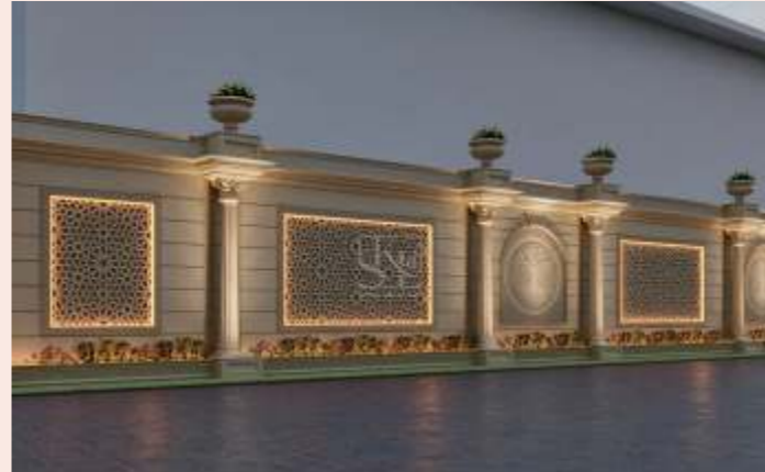
BOUNDRYWALL WITH GATE