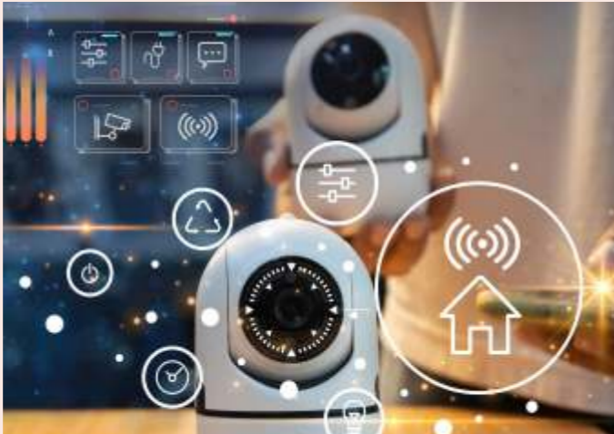
DOUBLE TIER SECURITY SYSTEM