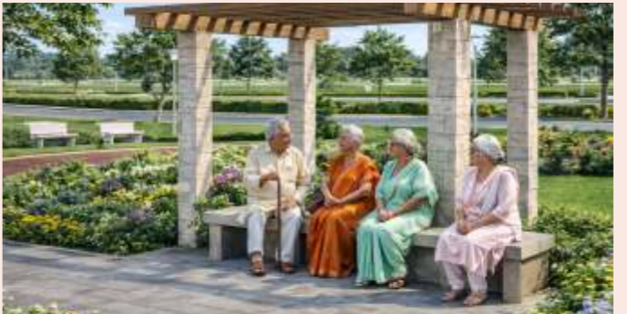
SENIOR CITIZEN SITTING AREA