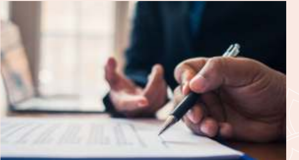
IMMEDIATE REGISTRY & MUTATION