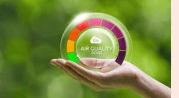
LOW AQI AREA