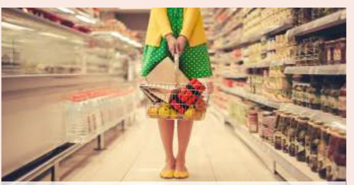
SHOPPING AREAS FOR DAILY NEEDS